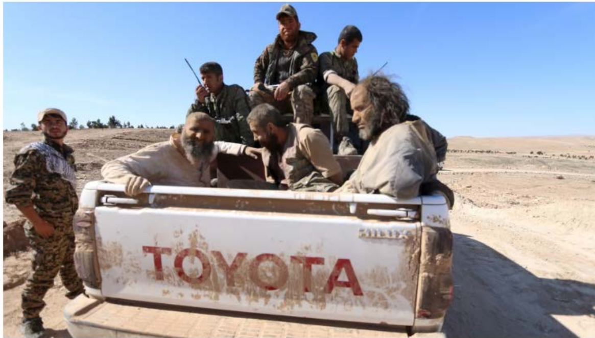
Syrian Democratic Forces soldiers transport captured Islamic State fighters in Syria in 2016.